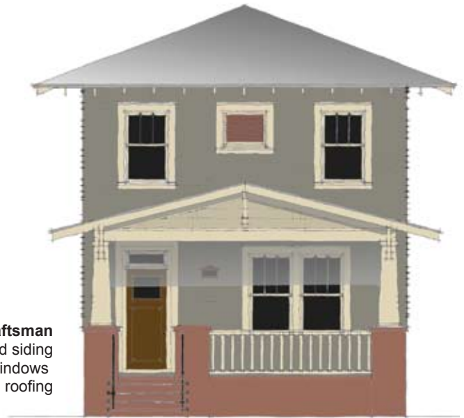
Craftsman stucco or clapboard siding 3 over 1 light double hung windows architectural shingles or metal roofing

1760 sq ft. • two level 3 Beds & 2.5 Baths