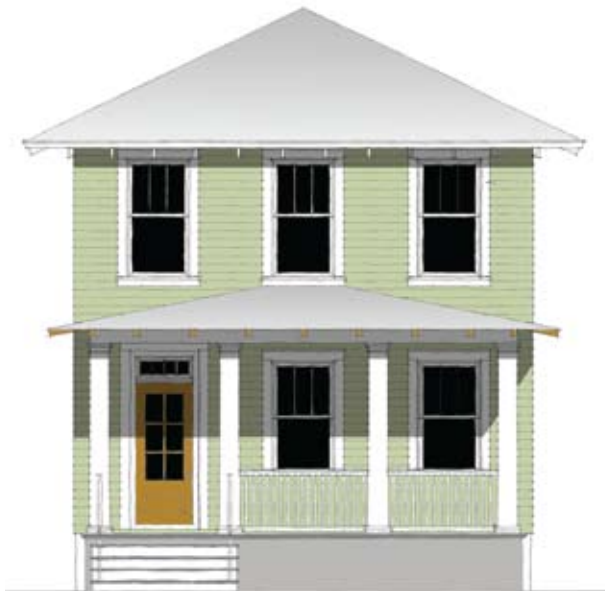
Vernacular stucco or clapboard siding 2 over 2 light double hung windows architectural shingles or metal roofing