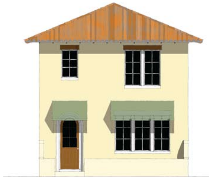
Spanish Colonial stucco exterior casement windows spanish barrel tile roofing

Size, square footage, and other dimensions are estimates; actual construction may vary. Size/square footage and price of your home may vary based on architectural styles, porches, materials, and options selected. Floorplans may vary according to architectural style. Prices, plans, dimensions, features, specifications, materials, and availability of homes are subject to change without notice or obligation. Please contact us to verify current information. Illustrations are artist's depictions only. They may differ from completed improvements and may change without notice.